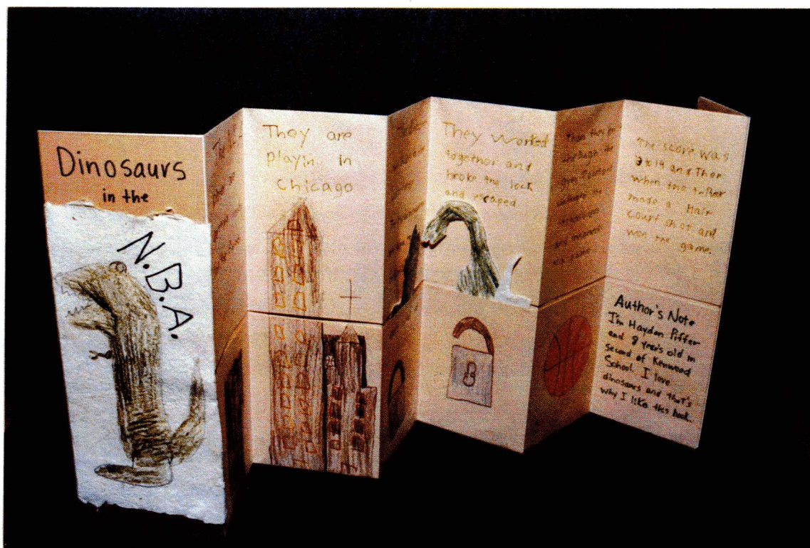
Books Uncovered: Treasures & Triumphs, 2000, Kenwood Elementary School, Hammond

Performance venues include: Symphony Center in Chicago, Purdue University Calumet/ Alumni Hall, Hammond Marina, U.S. District Courts in Downtown Hammond